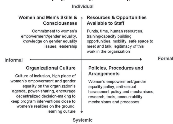
Figure 3: What Are We Trying to Change Within Organizations?

The same analysis can be applied to the implementing organizations themselves – see Figure 3 below, What Are We Trying to Change in Organizations? For example, what is the level of women and men's consciousness within the organization? Is there access to resources available to provide on these issues? What are the policies in the organization, and are they resourced or staffed? One can also then consider the organizational culture, power structures, and the way that the beliefs and systems work within the organization. For example, some organizations consider themselves to be learning organizations. The values that the organization holds shape the efficacy and sustainability of the initiatives it implements. In order for an organization to act as an agent of change in one or more of the clusters it must have certain capabilities and cultural attributes. Among these are a particular type of leadership, accountability to women clients, and a capacity for dialogue and conflict resolution. Figure 3 shows changes required within an organization. Similar to the earlier framework, the quadrants affect each other in a variety of ways.