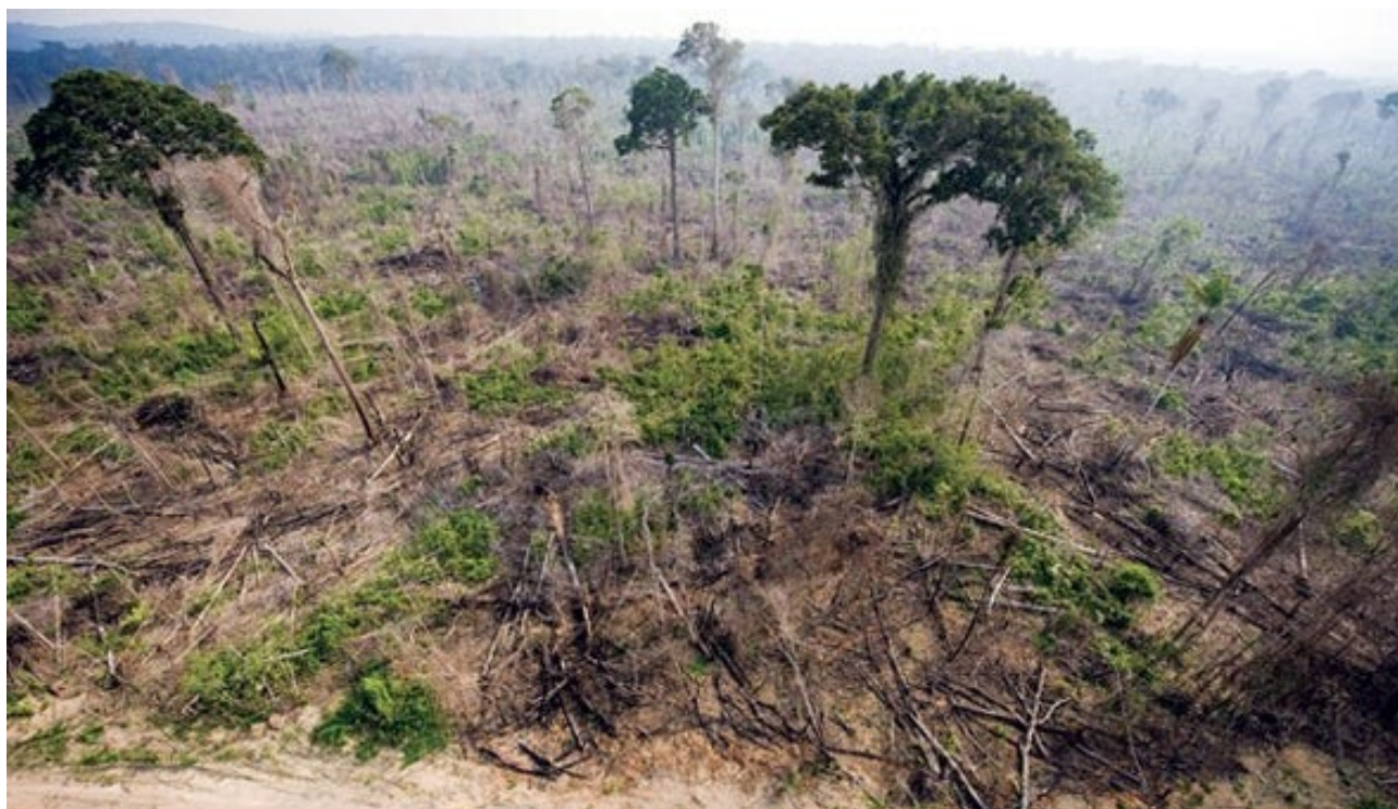
Figure 2: Aerial view of a cut down sector of the Jamanxim National Forest, Brazil.

Optimism about the transformative possibilities of the pandemic should be tempered by our knowledge that those responsible for creating the problem of climate change still retain their power to set the global development agenda. Already, we are seeing governments all over the world piggybacking on the Covid crisis to undermine and roll back the social and environmental gains achieved through years of struggle 2 .