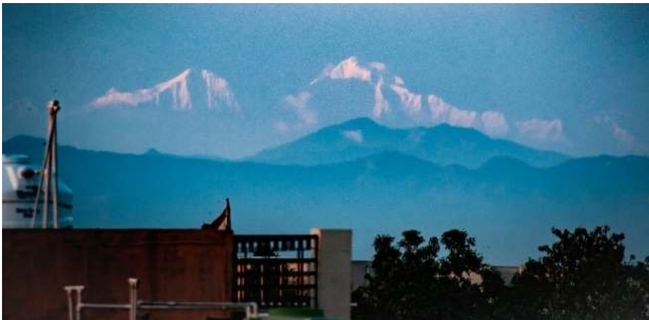
Figure 1: Snow-capped peaks of the Himalayas visible from Saharanpur, India for the first time in three decades.